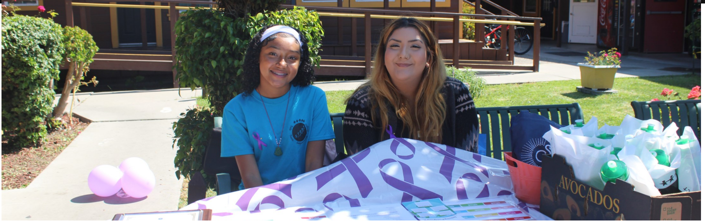
Photo: STEPS Youth Leader and Prevention Coordinator at Salinas Men's Residential Program

(September, 2024) To honor of National Recovery Month, STEPS Student Youth Leaders from the STEPS Program recently held their quarterly County-Wide Meeting in collaboration with the Salinas Men's Residential Program to host a variety of activities and workshops for the men to engage in, along with their families. The success of the event showcased the incredible impact that can be achieved when communities come together with a shared vision of support, growth, and positive change.