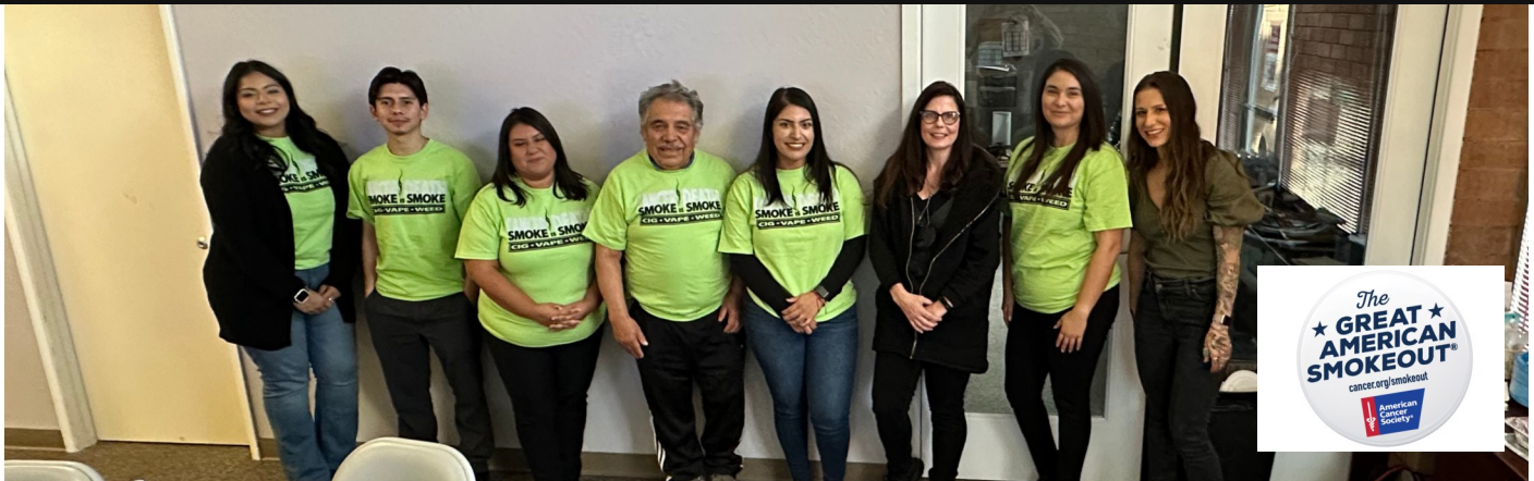
Photo: PARTS Coalition Members

(November, 2024) The Great American Smokeout (GASO) is an annual initiative organized by the American Cancer Society, taking place on the third Thursday of November. This campaign encourages individuals to either quit smoking on that day or use the day to make a plan to quit, aiming to lower the risks associated with tobacco-related diseases and premature death.