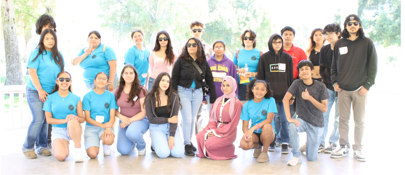
Photo: STEPS Program County-Wide group photo

(July, 2024) The Safe Teens Empowerment Project (STEPS) held its annual summer program retreat at San Lorenzo Park in King City, California. STEPS Youth Leaders from Salinas, Monterey Peninsula, and South Monterey County came together for a day filled with laughter and enjoyment under the sun. The students began their day with a community clean-up in partnership with Blue Zone's Project Monterey County and as the day went on STEPS engaged in various team-building activities, which included a cooking demonstration with Blue Zone's Project.