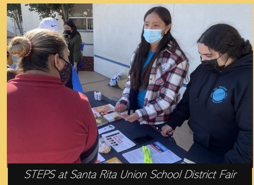
STEPS at Santa Rita Union School District Fair