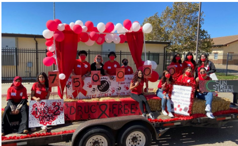
STEPS participated in Soledad High School Parade for Red Ribbon Week.

This past October, STEPS Program held an art contest in honor of Red Ribbon Week Campaign. Their art entry had to be related to a ' gateway drug ' topic. Congratulations to the winner representing STEPS Program in South County . In addition, STEPS Program in Soledad participated in Soledad High School parade.