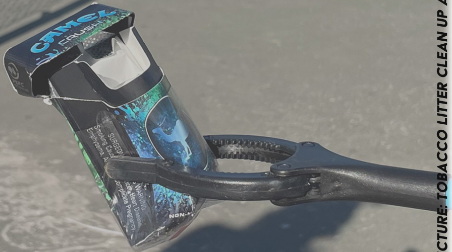
PICTURE: TOBACCO LITTER CLEAN UP AT NATIVIDAD CREEK PARK