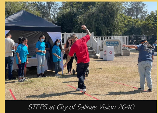
STEPS at City of Salinas Vision 2040