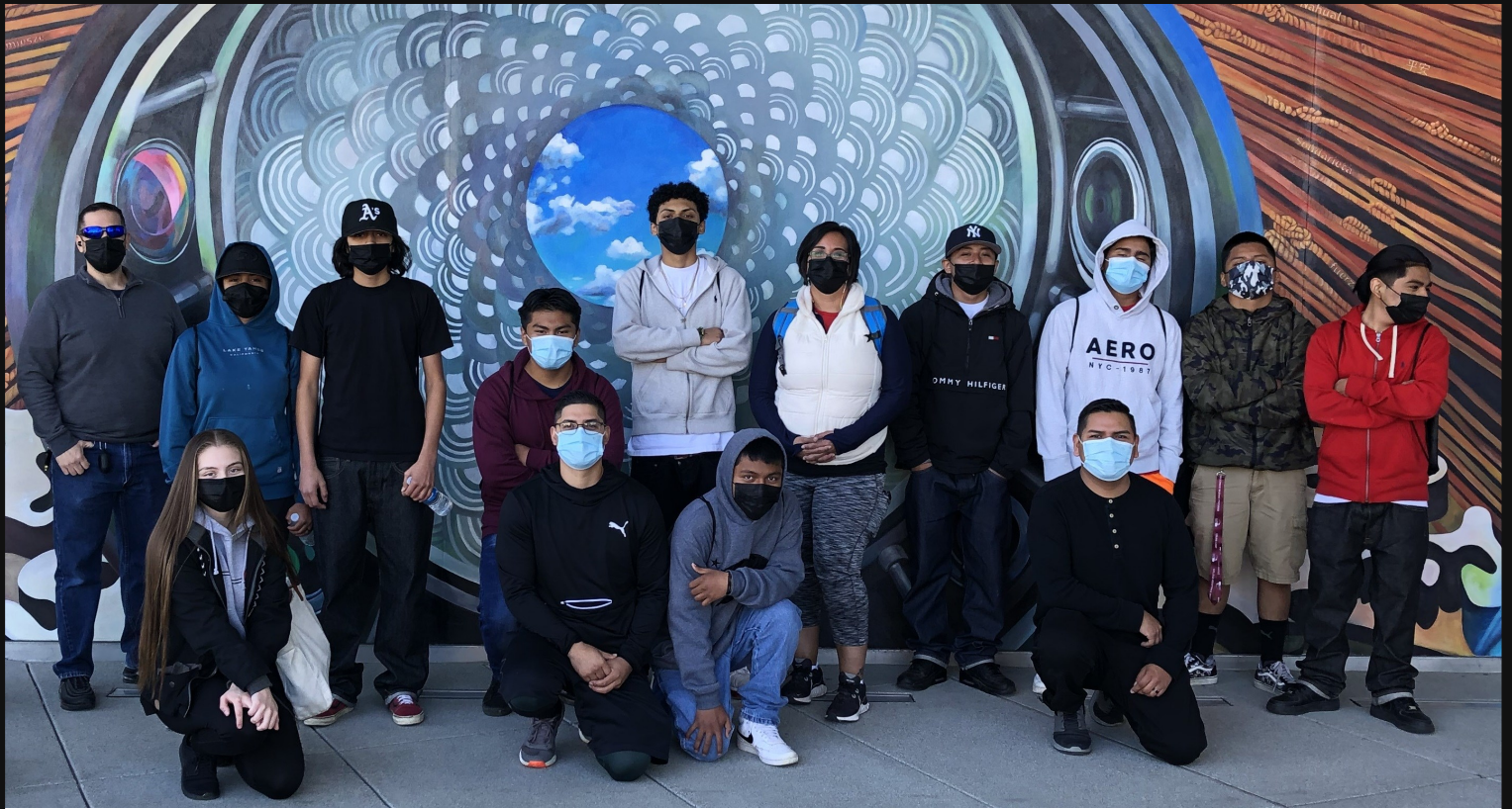
Photo: Road to Success Team and program participants & King City Police Department at CSUMB.

Road to Success is a pre-diversion program for youth, first time offenders of crimes. This 3 to 6-month program seeks to prevent school expulsion and/or entry into the juvenile justice system by offering youth offenders individualized diversion plans that include substance abuse intervention and education, participation in pro-social activities, individual and/or family counseling, parent workshops, and community service hours.