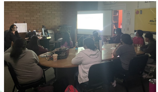
Tobacco Control Program presenting to in-person STEPS Meeting.

In honor of Great American Smoke Out , STEPS organized 3 tobacco litter clean-ups throughout Monterey County to share information with the community about the benefits of quitting smoking. Also, PARTS Coalition Member, Tobacco Control Program , provided presentations about Youth Advocacy, Tobacco Trends, and Letter Writing to virtual & in-person STEPS meetings.