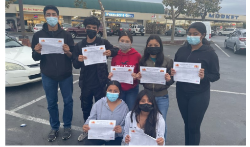
STEPS during Take Back flyer distribution at local pharmacies.

This past October, 4,276 law enforcement agencies across the United States ( 141 in California ) participated in DEA National Take Back Day campaign, collecting 744,082lbs (372 Tons) (41,970lbs in California) . Reducing the risks of accidental overdoses and deaths in our communities.