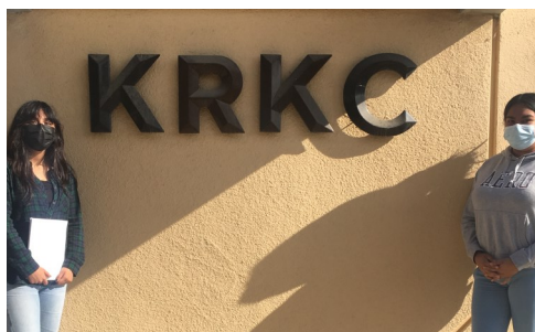
STEPS at KRKC Radio for Drive Sober or Get Pulled Over PSA recording.

This past December, STEPS Students worked with local radio station, KRKC Radio, to create radio commercials about safe and sober driving in honor of Drive Sober or Get Pulled over. Students also reviewed information about drugs that impair your driving ability and created a 30second video about drugged driving that was shared on social media outlets.