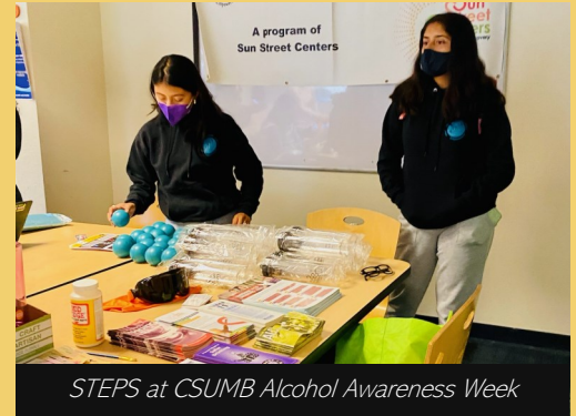
STEPS at CSUMB Alcohol Awareness Week