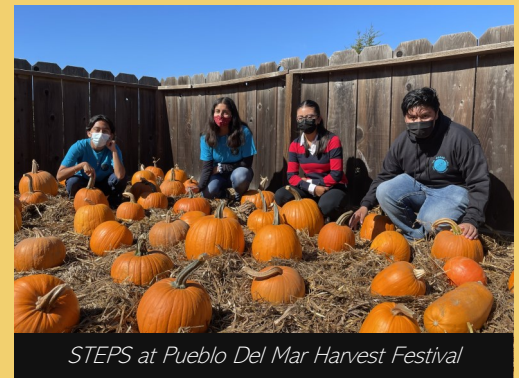
STEPS at Pueblo Del Mar Harvest Festival