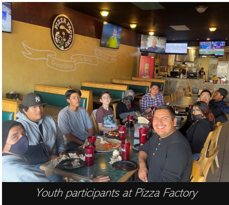
Youth participants at Pizza Factory

Road to Success is a pre-diversion program for youth, first time offenders of crimes. This 3 to 6-month program seeks to prevent school expulsion and/or entry into the juvenile justice system by offering youth offenders individualized diversion plans that include substance abuse intervention and education, participation in pro-social activities, individual and/or family counseling, parent workshops, and community service hours.