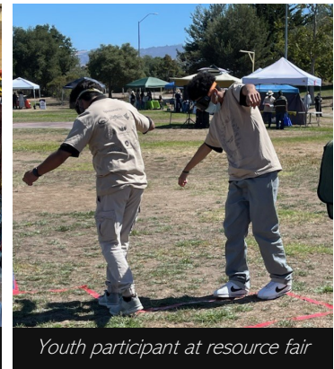
Youth participant at resource fair

This program reported 26 youth who successfully completed the program, 12 of them being from Juvenile Hall . In total, the graduating youth completed 261 hours of community service and 270 pro-social hours . Pro-social hours are hours that the youth invests to explore positive opportunities to engage in.