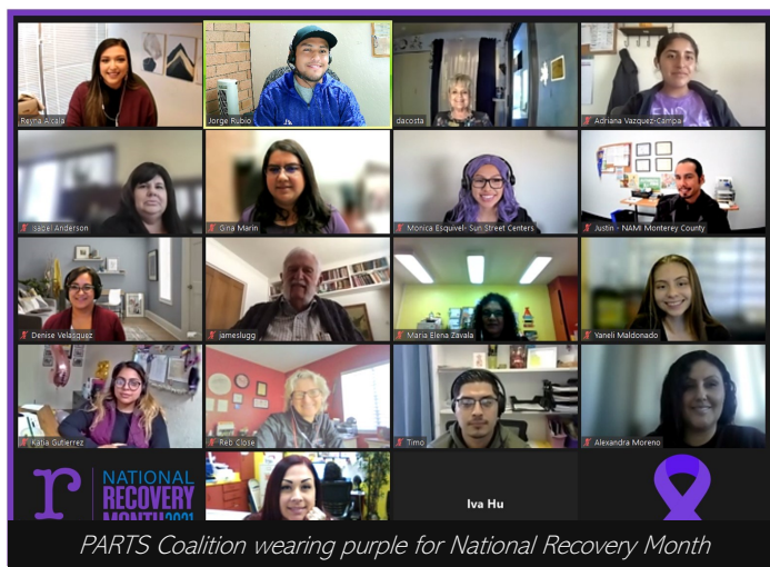
PARTS Coalition wearing purple for National Recovery Month