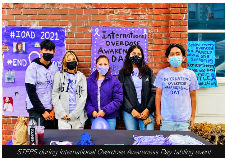
STEPS during International Overdose Awareness Day tabling event

STEPS Program and PARTS Coalition supported the campaign by wearing purple during the month of September. They also created social media posts and contributed to a positive quote activity. The quotes collected were posted through posters and chalk at our recovery center in Salinas, Marina, and King City .