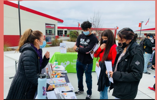
Peninsula at Seaside High School resource fair

SALINAS SEASIDE PORTOLA BUTLER HIGH SCHOOL SOLEDAD HIGH SCHOOL