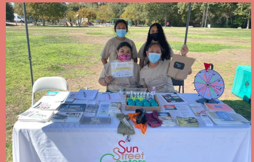
STEPS in Salinas at End of Summer Celebration