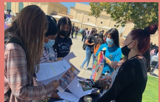
South County STEPS Orientation at Soledad High