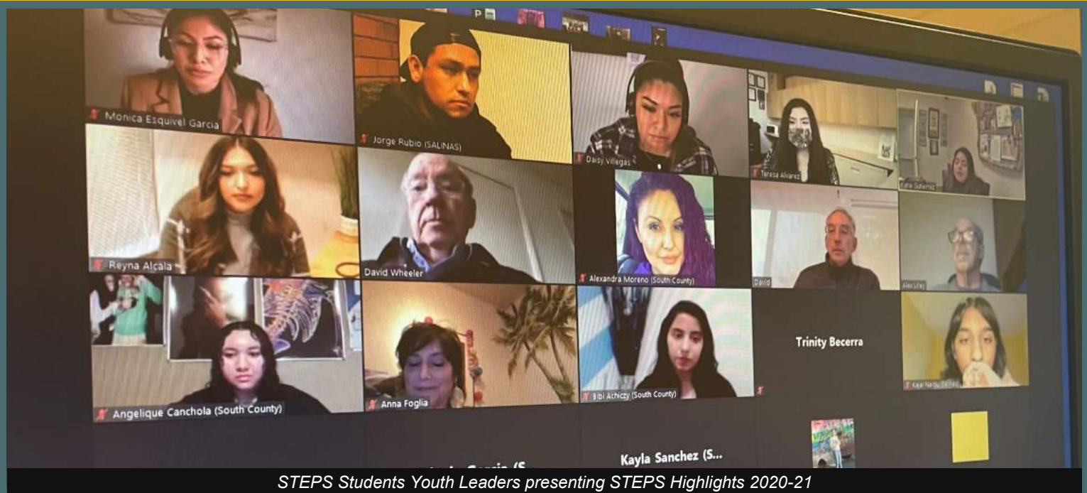
STEPS Students Youth Leaders presenting STEPS Highlights 2020-21