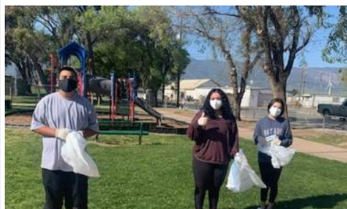
STEPS at tobacco litter clean-up in Soledad

For the month of March, STEPS Student Youth Leaders focused their efforts on tobacco prevention and education. STEPS reviewed information about youth tobacco use, new tobacco trends, and tobacco marketing and advertisement tactics aimed towards youth ( replacement smokers ). Within the tobacco industry, documents refer to children as replacement smokers who will replace the current smokers who will die prematurely. Using the information reviewed, STEPS students entered an art contest organized by Sun Street Centers' Prevention Department to visually reveal the truth about tobacco.