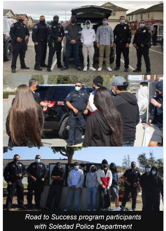
Road to Success program participants with Soledad Police Department