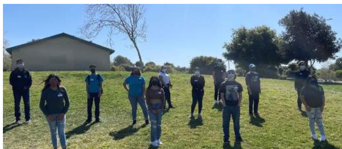
STEPS at tobacco litter clean-up in Salinas

Joining the thousands of advocates across the nation on this day of action, STEPS program participated in a virtual event, ' A Roast of Big Tobacco ' organized by Campaign for Tobacco-Free Kids. In addition, students planned and conducted a tobacco litter clean-up in Salinas, Monterey, and Soledad.