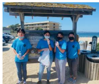
STEPS at tobacco litter clean-up in Monterey

(March, 2021) Tobacco use is the number one cause of preventable death in the United States and around the world, with 5.6 million kids alive today who will die prematurely from smoking. This is just some information that Campaign for Tobacco-Free Kids shares during Take Down Tobacco , national day of action. Take Down Tobacco campaign raises awareness on the impact tobacco has in our community and encourages youth to learn the facts about the dangers of tobacco use, especially e-cigarette products.