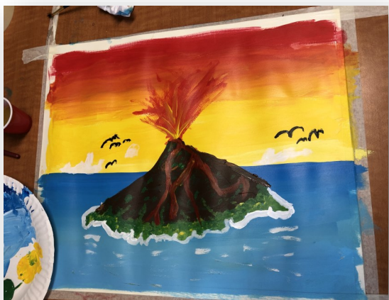
Acrylic painting by a Program youth.