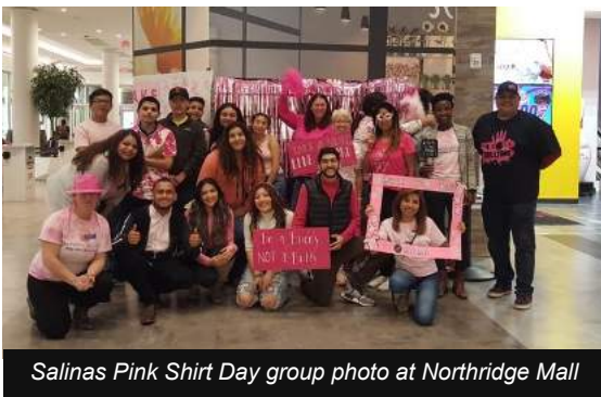
Salinas Pink Shirt Day group photo at Northridge Mall