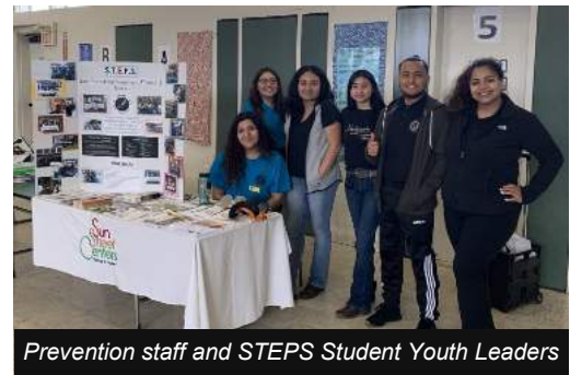
Prevention staff and STEPS Student Youth Leaders

Hartnell College NASA Family Café Resource Fair: Lincoln Elementary School