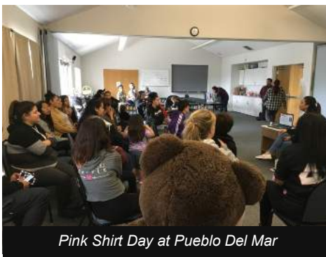
Pink Shirt Day at Pueblo Del Mar