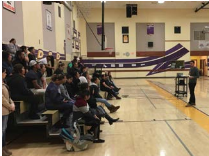
Parent presentation at Soledad High School