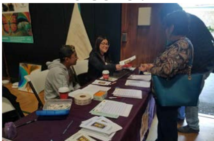
STEPS at Juntos Podemos Forum

STEPS volunteered throughout the event which focused on the importance of healing through art. Also, STEPS had a table where they gave out information about drugs and alcohol.