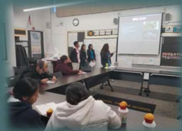
STEPS facilitate Gateway Drug Presentation.

STEPS facilitated Gateway Drug Presentation 8 Parents