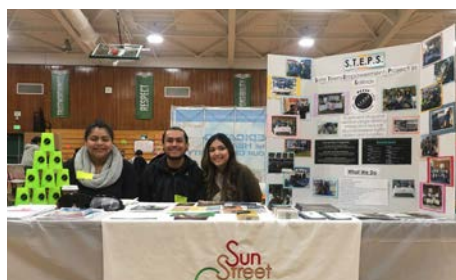
Staff spoke to over 130 youth about substance abuse

Prevention staff attended Alisal High School Health Fair which highlighted the importance of making healthy decisions such as avoiding risky behaviors, eating healthy, and staying active.