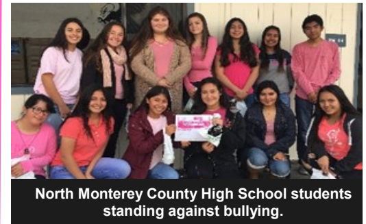
North Monterey County High School students standing against bullying.