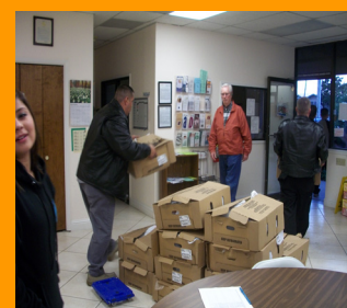
City Council & 8th Annual Turkey Drive