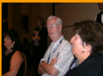
PARTS meeting & Training