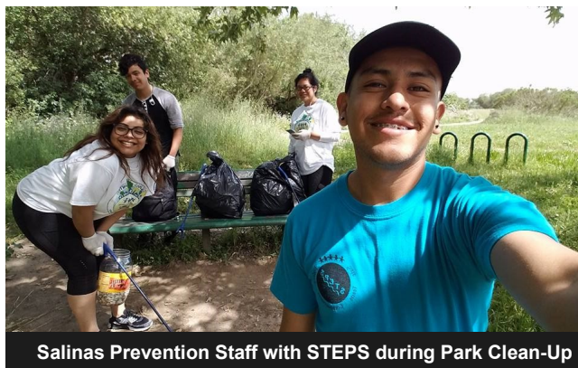
Salinas Prevention Staff with STEPS during Park Clean-Up