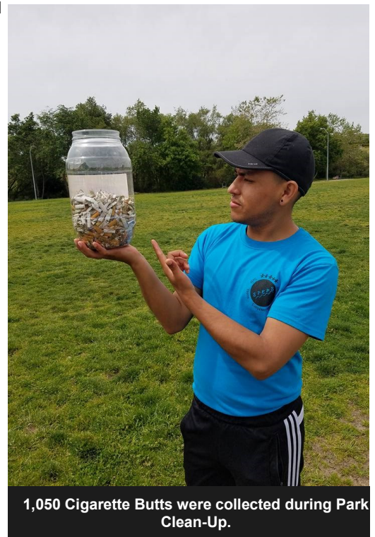
1,050 Cigarette Butts were collected during Park Clean-Up.