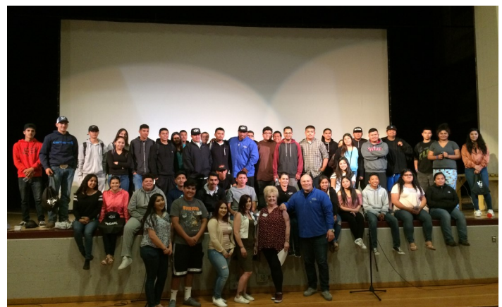
South County Prevention Staff, WYSM Staff, and KCHS Students

South County Prevention along with King City High School (KCHS) conducted a WYSM training for 70 high school students.