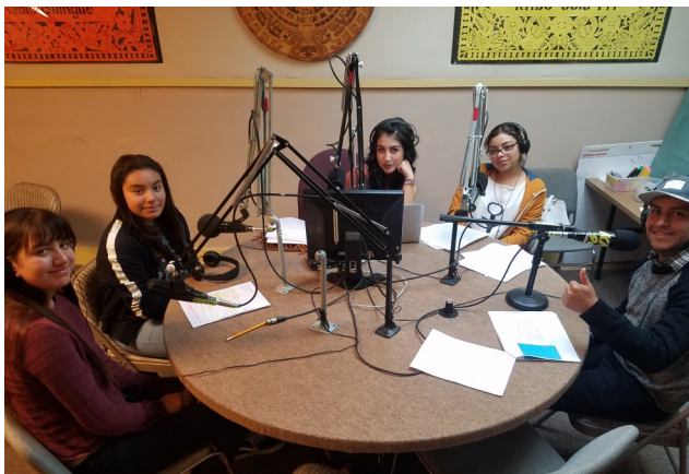
Salinas STEPS and Alza Tu Voz Youth