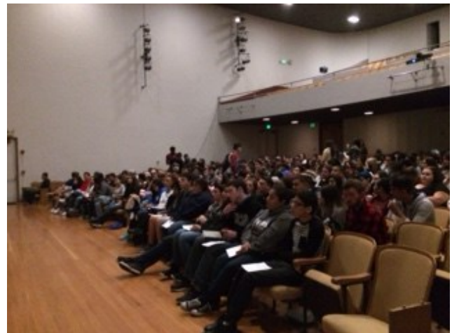
Students at KCHS

King City H.S. joins Sun Street Centers and Natividad Trauma Center to bring awareness about Distracted and Drunk Driving to 225 high school students.