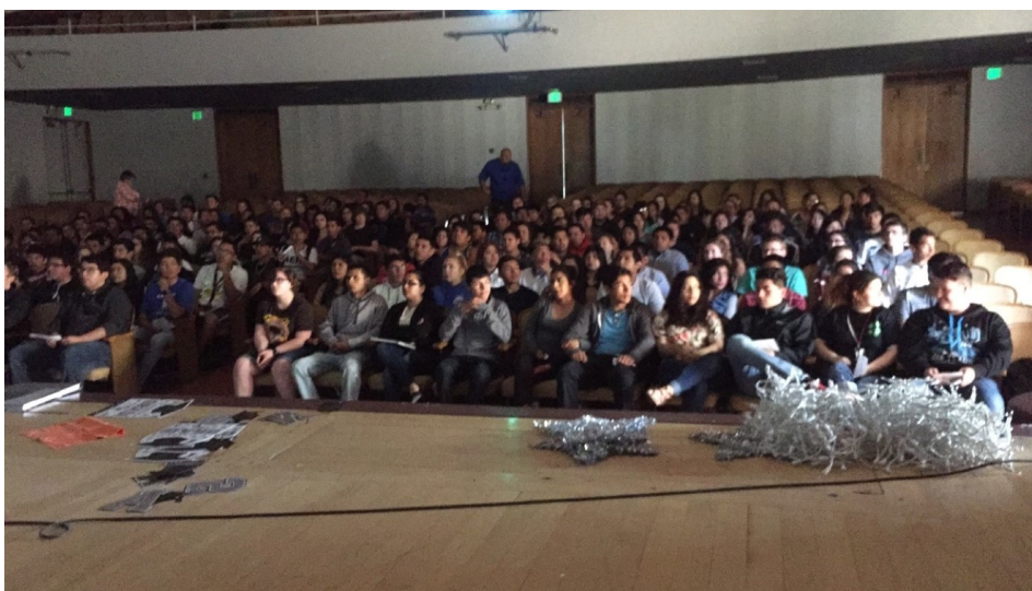
In-One-Instant at King City High School

We worked with over 300 students to help create consciousness on the initial effects of distracted and drunk driving followed by a vow/pledge to be safe while driving to help save not only their lives, but the lives of the people around them.