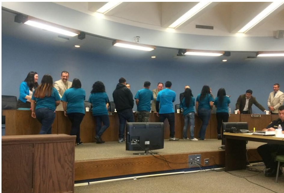
"The Road to Recovery"