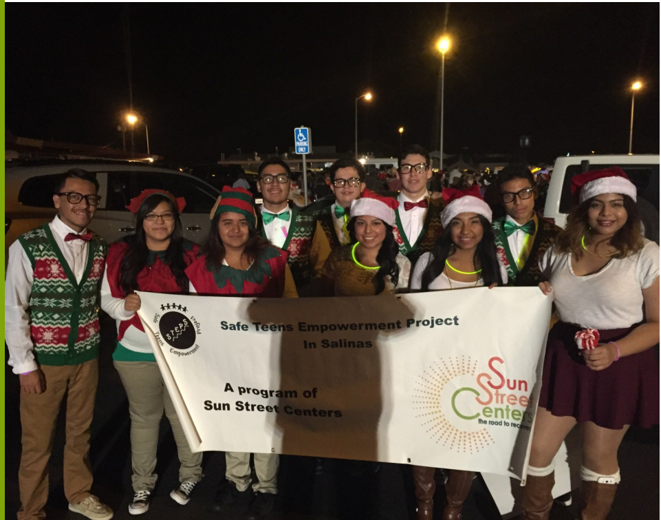
Salinas STEPS at Parade of Lights